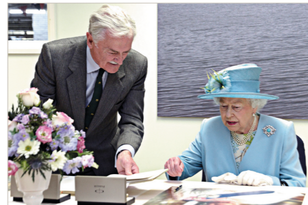
Her Majesty visits John Smedley in 2014

Following this, guests will visit the John Smedley Factory, where luxury fine gauge knitwear has been manufactured since 1784. Guests will have a chance to explore the Archive of this remarkable 240-year-old family company, see the 2025 Spring/Summer collection and have a chance to visit the mill shop.